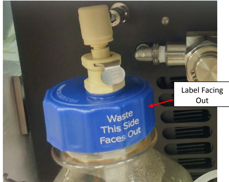
Figure 3 – Connecting the Bottle to the Water Works System